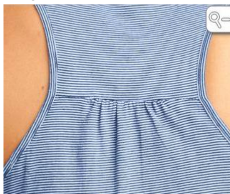
lapis blue stripe closeup