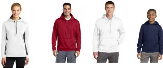
(C) 100% polyester SPORT WICKING HOODIES