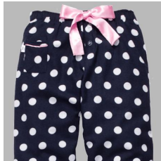
(V)spot on navy