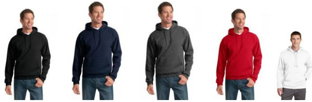
(A) PULLOVER HOODED SWEATSHIRT