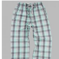
(W)mint & gray plaid